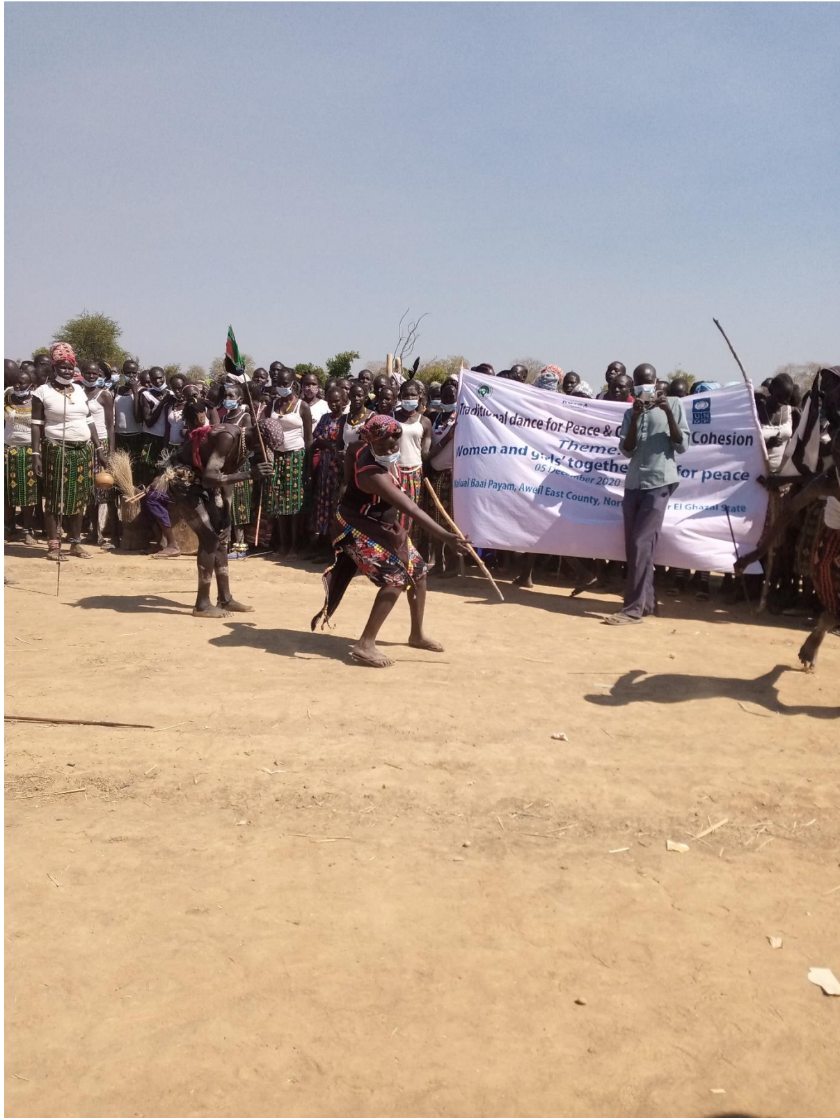
Using cultures for Peace & Community Cohesion in Malual Baai payam, Aweil East, NBG