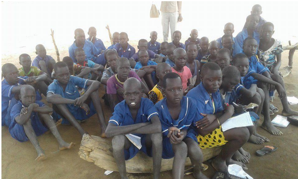
Pupils listening to the Mentors of Hope Africa South Sudan