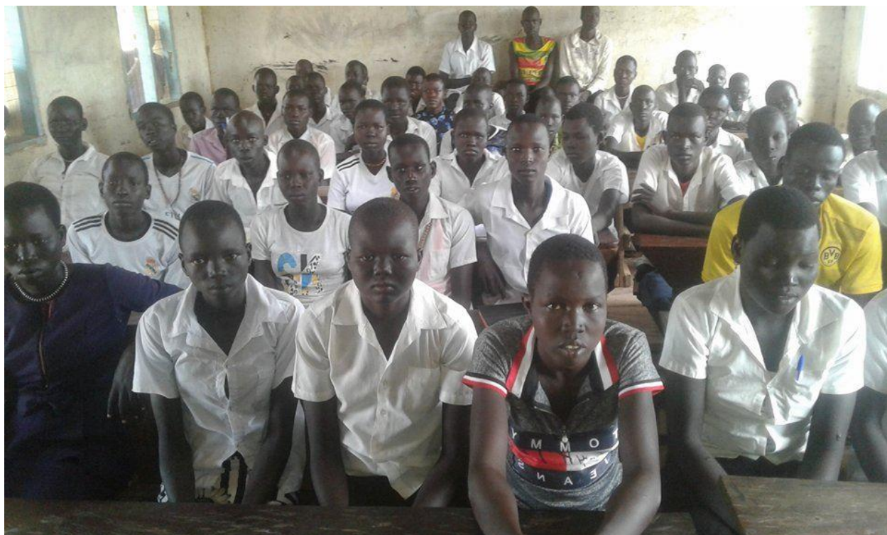
P.8 students listening to the mentor of Hope Africa South Sudan at Madhol Primary School